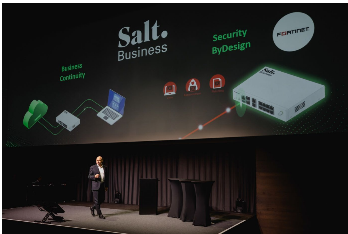
Product Launch Event for Corporate Internet at Aura, in Zurich

Salt Business launches Corporate Internet, a new nationwide corporate connectivity solution for companies in Switzerland. The offering delivers high-performance internet access with built-in business continuity and advanced security powered by Fortinet, while maintaining Salt's trademark excellent pricing.